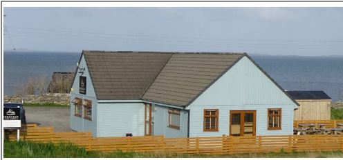
Berneray Shop and Bistro